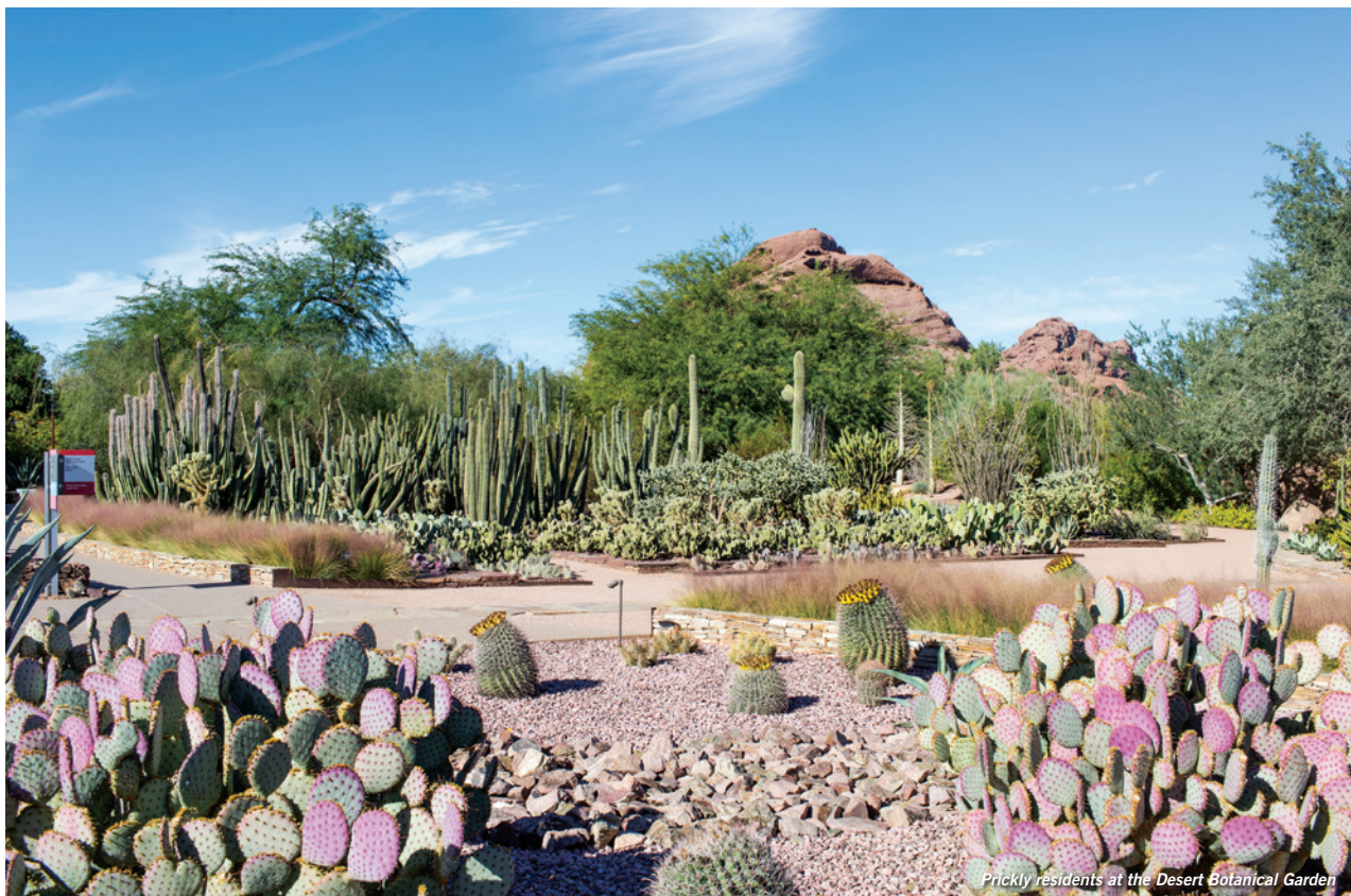
Prickly residents at the Desert Botanical Garden