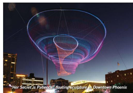
"Her Secret Is Patience" floating sculpture in Downtown Phoenix