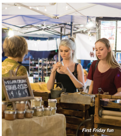
First Friday fun

Head downtown to Pizzeria Bianco (623 E Adams St.) for tasty wood-fired pies like the texture-rich Rosa topped with red onion, Parm, rosemary, and Arizona pistachios. Crudo (3603 E Indian School Rd.), serves up a mean brunch—try the bacon risotto with sunny-side-up eggs. In Tempe at Postino (615 S College Ave.), pair bruschetta with a glass of local wine.