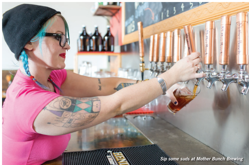
Sip some suds at Mother Bunch Brewing

The heart of Phoenix's art district is Roosevelt Row—a road featuring eclectic art galleries, shops, and colorful outdoor murals. Highlights include Modified Arts (407 E Roosevelt St.), a space dedicated to showcasing local artists, and the Halt Gallery (408 E Roosevelt St.), a shipping-container-turned gallery. Go on first or third Fridays when the city shuts down the surrounding streets and essentially throws an art party. Also on first Fridays, the Phoenix Art Museum (1625 N Central Ave.) offers gratis admission (as well as a shuttle to Roosevelt Row). Visit Frank Lloyd Wright's winter home, Taliesin West (12621 N Frank Lloyd Wright Blvd.), in Scottsdale, where his incorporation of the stark desert beauty is awe-inspiring.