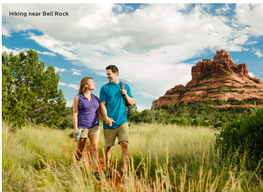
Hiking near Bell Rock

If you're in the mood for more hiking, you can get up close to Capitol Butte on the relatively easy, 1.9-mile Sugarloaf Loop Trail. The Devil's Bridge sandstone arch has become a social media star and is one popular 4.2-mile out and back hike. Crescent Moon Ranch or Red Rock Crossing offer beautiful views of Cathedral Rock—the most photographed red rock in Sedona.