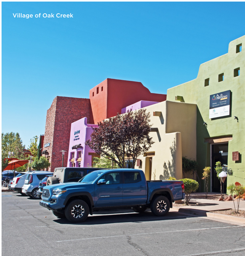
Village of Oak Creek