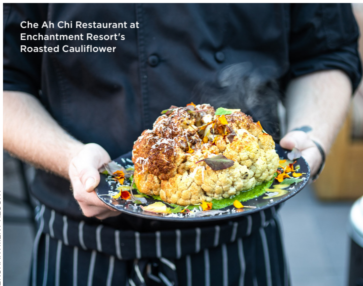
Che Ah Chi Restaurant at Enchantment Resort's Roasted Cauliflower

Additional restaurants include local gem Judi's Restaurant & Lounge, which has been in business for more than 30 years. Feast on fine food with Native American influences at Enchantment Resort's Che Ah Chi.