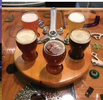
Clockwise from top left: Downtown Tucson; craft beer tasting at Marana microbrewery Catalina Brewing Company; group meditation at Canyon Ranch; the spa deck at Life in Balance Spa at Miraval.